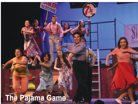
The Pajama Game