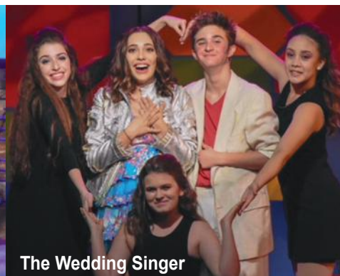
The Wedding Singer