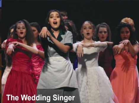
The Wedding Singer